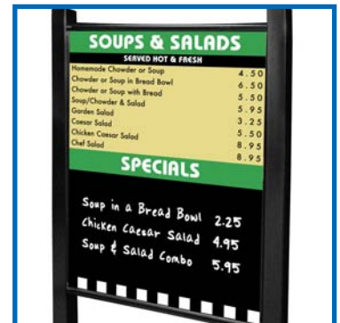
Wet or Dry Erase